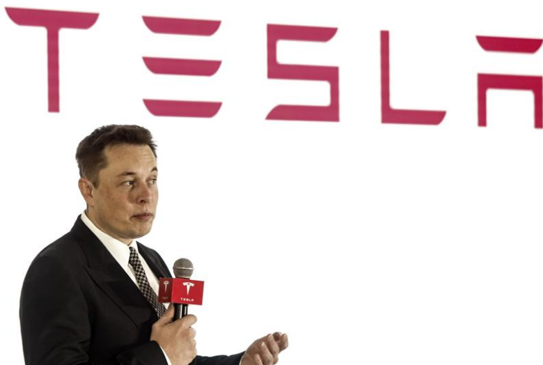
Tesla CEO Elon Musk said the company will soon hold a shareholder vote to transfer the company’s state of incorporation to Texas.

Tesla CEO Elon Musk on Thursday said the electric vehicle maker will hold a shareholder vote to transfer the company’s state of incorporation to Texas, after publicly lashing out at Delaware—where the company is currently incorporated—over a court decision that voided the billionaire’s massive $50.9 billion pay package.